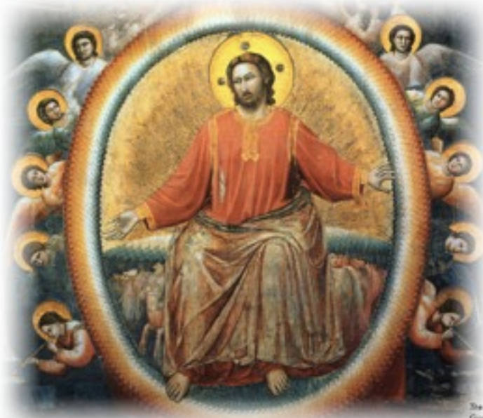
The Last Judgment Giotto 1304-1306

DEATH JUDGMENT HEAVEN HELL CCC 1020-1060