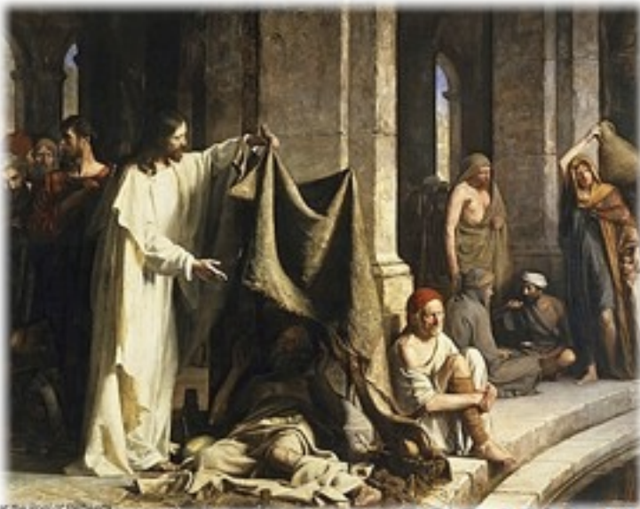
Healing at the Pool of Bethesda Caravaggio 1593