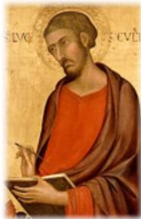
St. Luke Simone Martini 1335