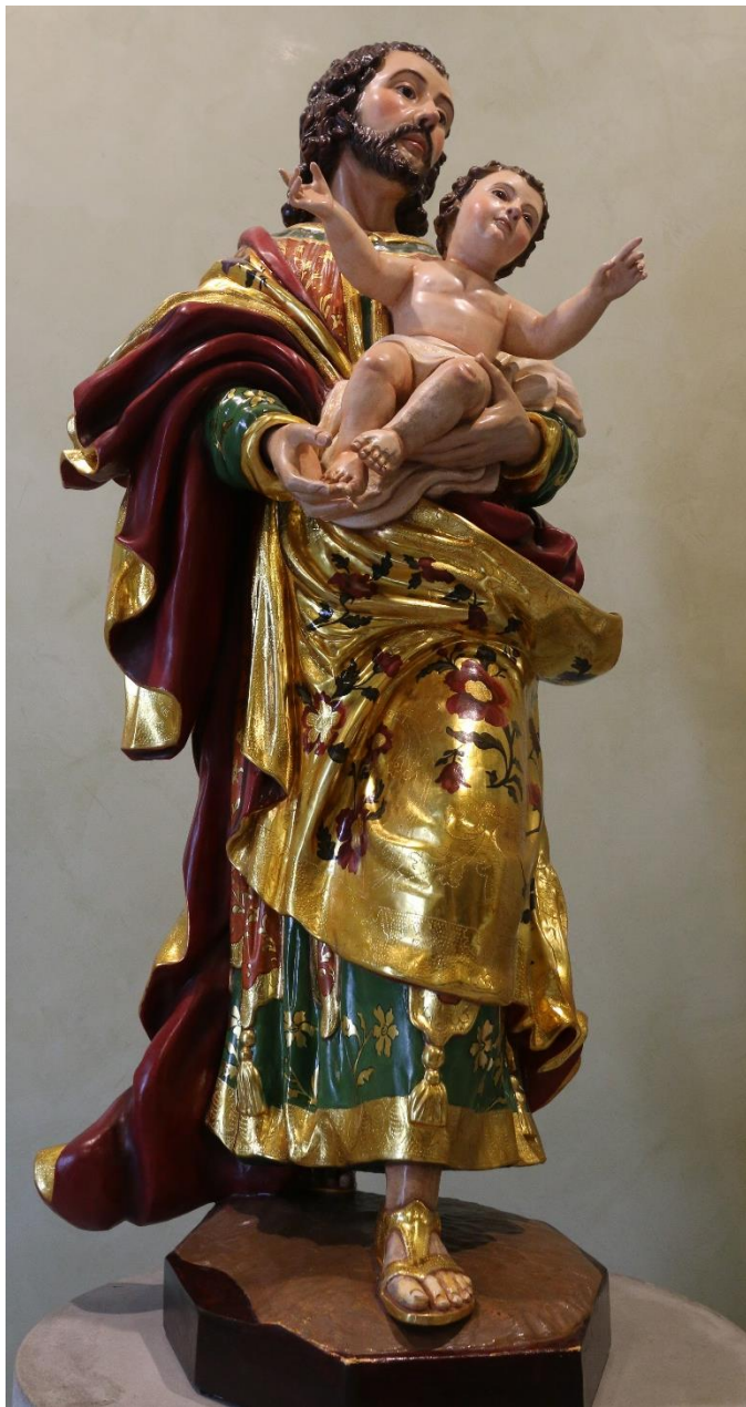
Cathedral of Christ the Light Oakland, CA