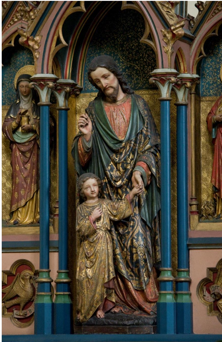
St. Joseph with the Christ Child Corpus Christi Catholic Church, Brixton, England

St. Joseph, you are the chaste and loving spouse of the Virgin Mary, the foster father of Jesus, the protector and provider of the Holy Family and of all families. We have complete confidence in your loving care for new life and in your fidelity to the family. We commend our efforts to your prayers and protection. Help us always to defend the gift of human life that it may grow to the abundance of eternal life promised and bestowed on us by your son, our brother, Jesus Christ. Amen.