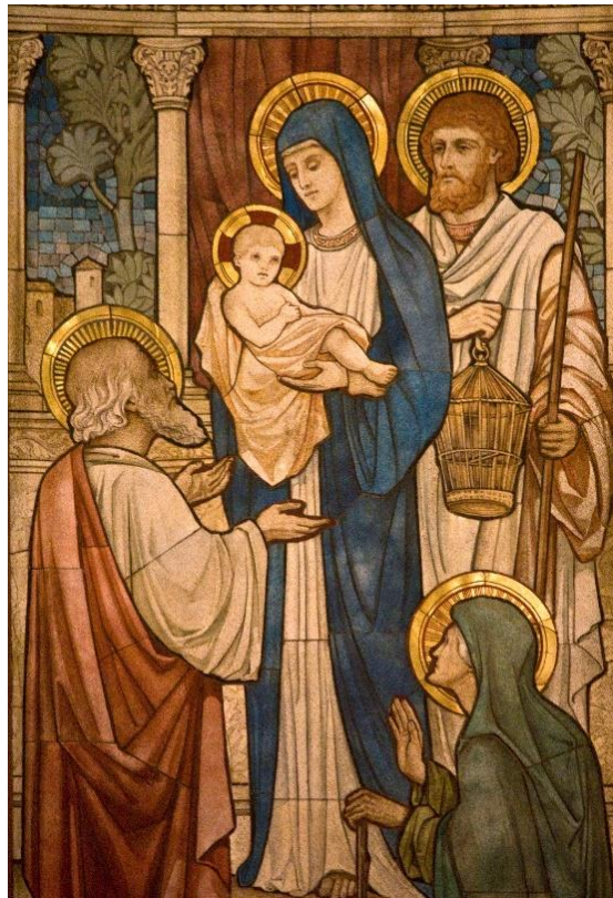
Presentation of the Lord St. Mary's Church, Balham, South London

There was also a prophet, Anna the daughter of Phanuel, of the tribe of Asher. She was of a great age, having lived with her husband seven years after her marriage, then as a widow to the age of eighty-four. She never left the temple but worshiped there with fasting and prayer night and day. At that moment she came, and began to praise God and to speak about the child to all who were looking for the redemption of Jerusalem.