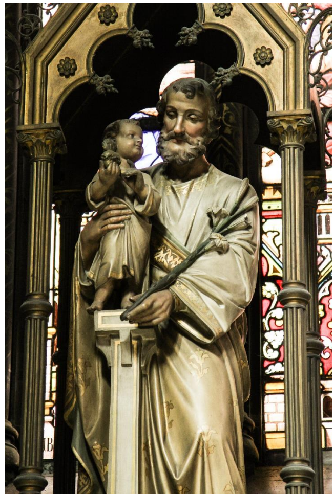
St. Joseph Church of the Sacred Heart of Jesus Lille, France

https://teachingcatholickids.com/st-joseph-saints-for-kids/