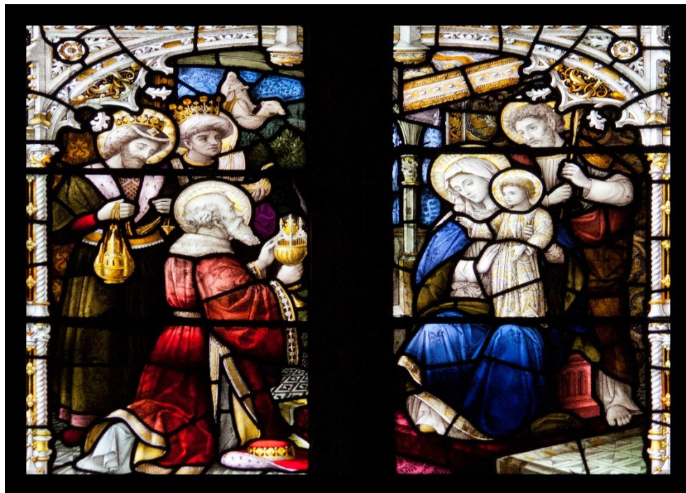
Downside Abbey Church, Benedictine Monastery Stratton-on-the-Fosse, England

Then Herod secretly called for the wise men and learned from them the exact time when the star had appeared. Then he sent them to Bethlehem, saying, “Go and search diligently for the child; and when you have found him, bring me word so that I may also go and pay him homage.” When they had heard the king, they set out; and there, ahead of them, went the star that they had seen at its rising, until it stopped over the place where the child was. When they saw that the star had stopped, they were overwhelmed with joy. On entering the house, they saw the child with Mary his mother; and they knelt down and paid him homage. Then, opening their treasure chests, they offered him gifts of gold, frankincense, and myrrh. And having been warned in a dream not to return to Herod, they left for their own country by another road.