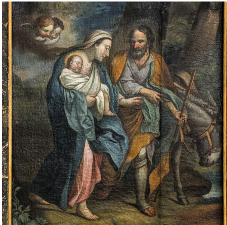
Flight into Egypt Abbey of Pontigny, Burgundy, France

As once you rescued the Child Jesus from deadly peril, so now protect God's Holy Church from the snares of the enemy and from all adversity; shield, too, each one of us by your constant protection, so that, supported by your example and your aid, we may be able to live piously, to die in holiness, and to obtain eternal happiness in heaven. Amen.