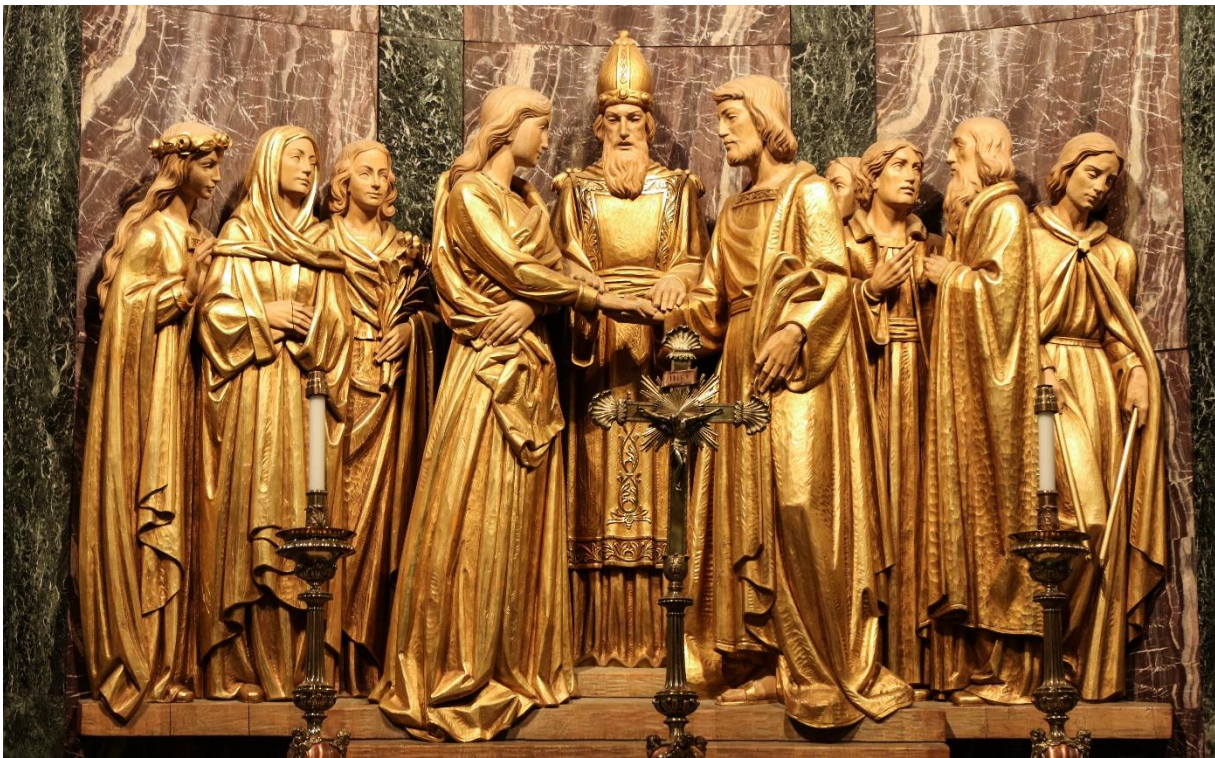
“Marriage of the Virgin Mary and St. Joseph” St. Matthew Cathedral, Washington, DC

which means, “God is with us.” When Joseph awoke from sleep, he did as the angel of the Lord commanded him; he took her as his wife, but had no marital relations with her until she had borne a son; and he named him Jesus.