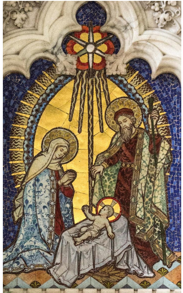
The Nativity of Christ The Cathedral Church of Our Lady of Good Aid (Motherwell Cathedral), Motherwell, Scotland