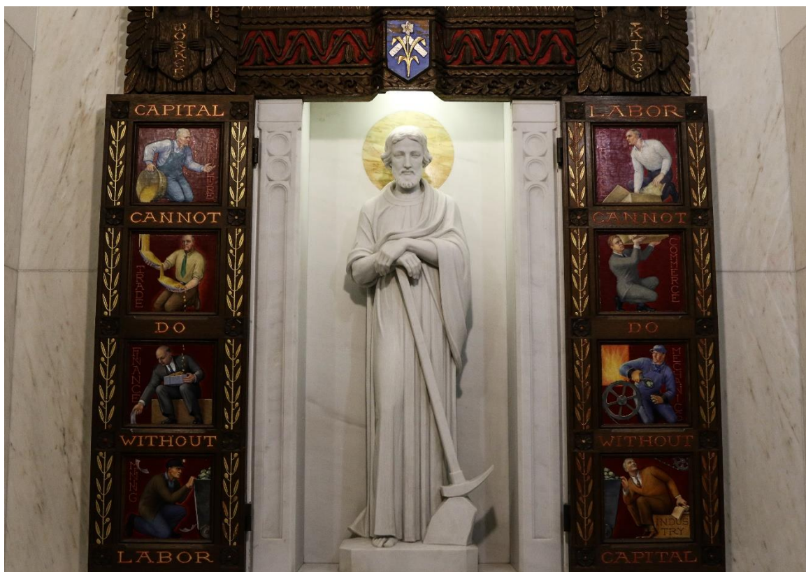
St. Joseph the Worker Basilica of the National Shrine of the Little Flower Detroit, Michigan

God our Father, creator and ruler of the universe, in every age you call man to develop and use his gifts for the good of others. With St. Joseph as our example and guide, help us to do the work you have asked and come to the rewards you have promised.