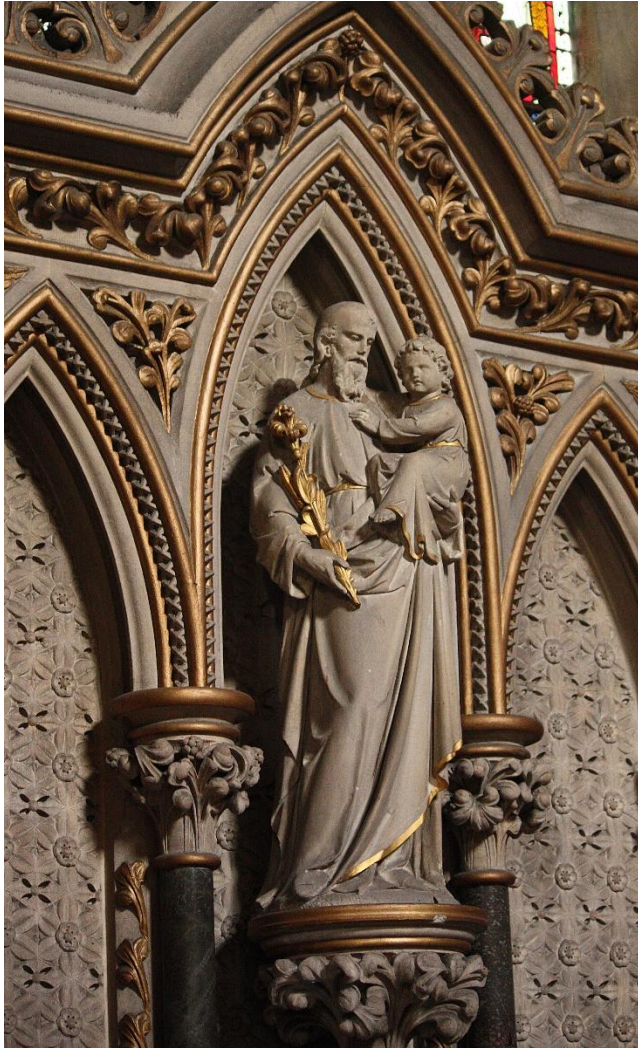
St. Joseph St. Dominic's Priory, London