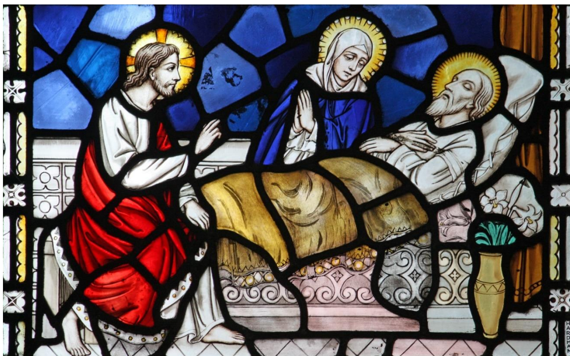
The Death of St. Joseph The Church of Our Lady of the Assumption and the English Martyrs Cambridge, England

Let us pray. O glorious Saint Joseph, spouse of the Immaculate Virgin, obtain for us pure, humble and charitable minds, and perfect resignation to the divine will. Be our guide, father, and model through life, that we may merit to die as you did, in the arms of Jesus and Mary.