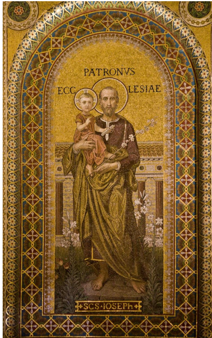
St. Joseph the Guardian Basilica of St. Lawrence Outside the Walls Rome, Italy