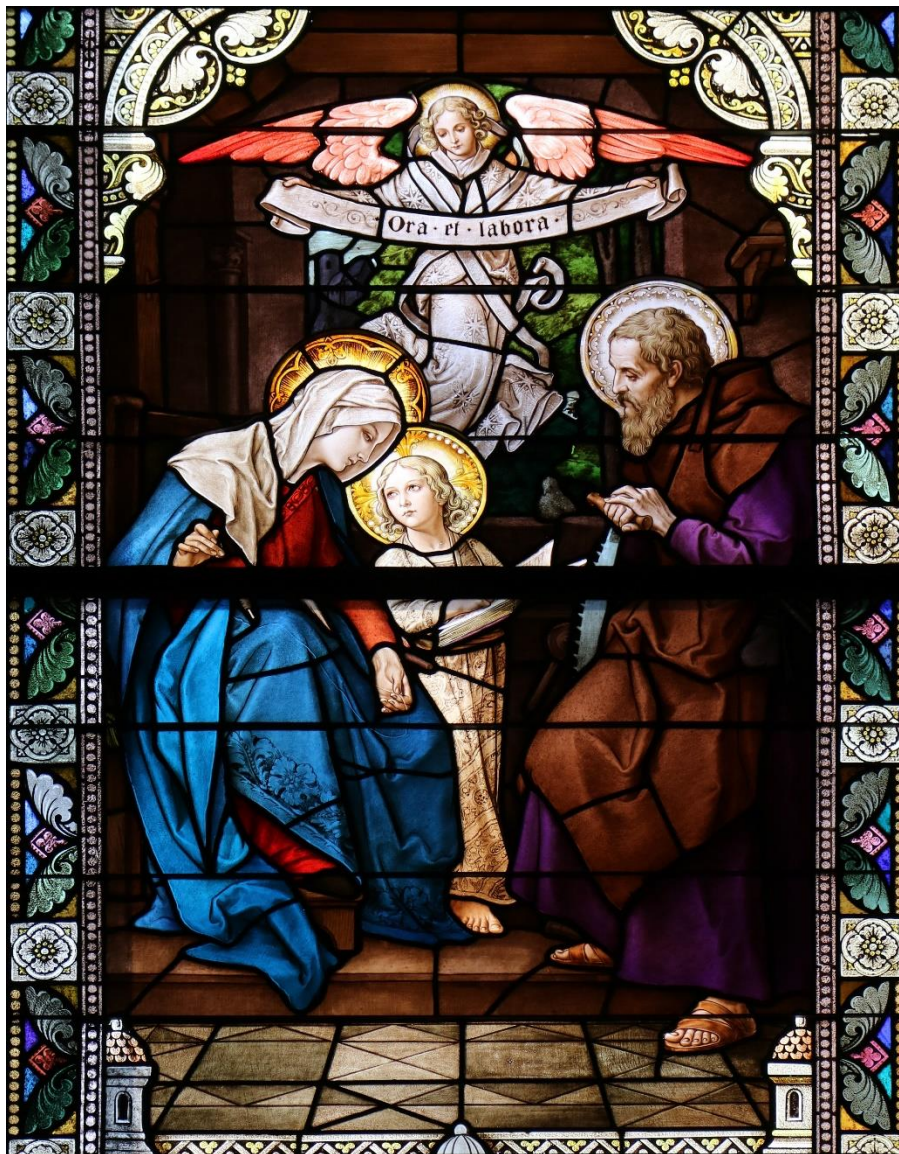
The Holy Family Abbey of Pontigny, Burgundy, France

Blessed Joseph, to us too, show yourself a father and guide us in the path of life. Obtain for us grace, mercy and courage, and defend us from every evil. Amen.