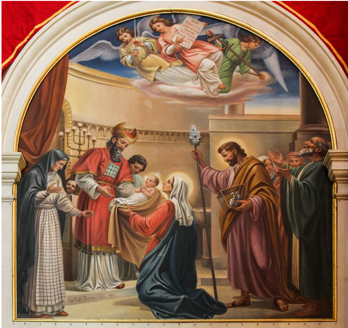
The Holy Family in the Temple Vittoriosa, Malta