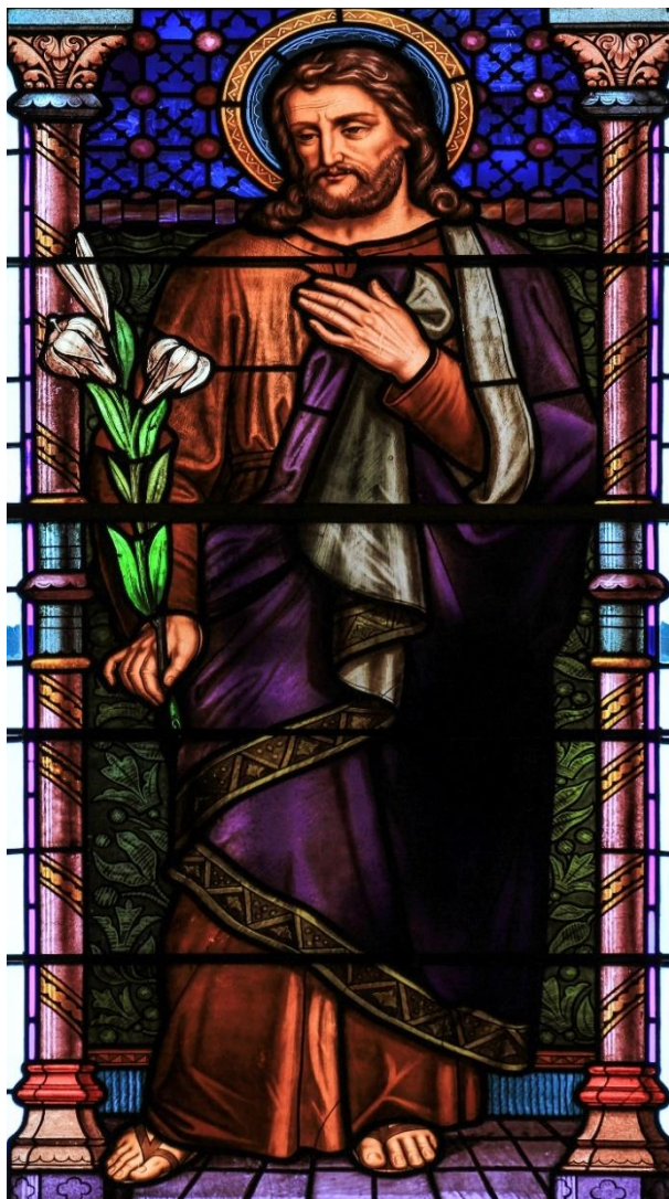
St. Joseph St. Dominic's Church, Washington, DC